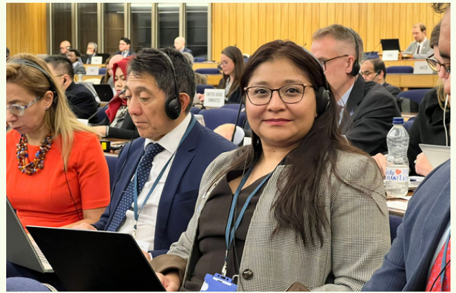
IMLI Graduates attending IMO Council as part of their home country's distinguished delegations