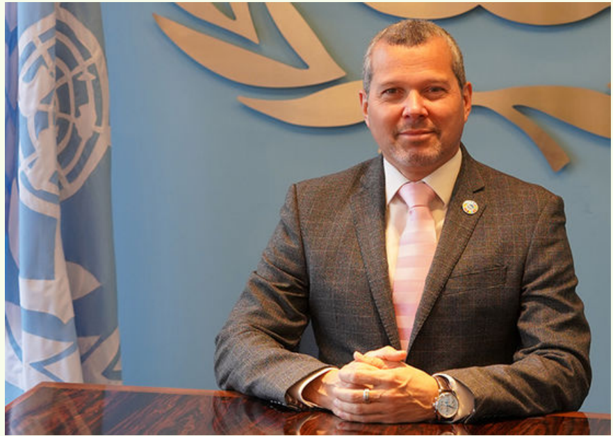
IMO Secretary-General Elect Mr. Arsenio Antonio Dominguez Velasco

The IMO Assembly at its 33rd Session, has unanimously approved the decision of the IMO Council to appoint Mr. Arsenio Antonio Dominguez Velasco from Panama, as the next Secretary-General of the IMO. His tenure will run from 1 January 2024 to 31 December 2027.