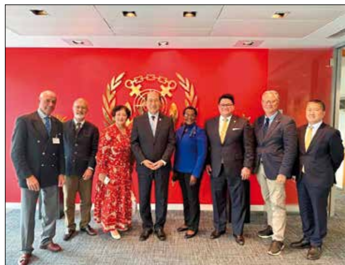
The Members of the IMLI Governing Board at the 37 th Session

The Board considered reports on financial and academic matters, as well as IMLI's contribution to the IMO Goals and UN 2030 Sustainable Development Agenda. The Board noted with satisfaction the Institute's efforts to enhance its global outreach and the appreciation expressed by the General Assembly of the United Nations and IMO Bodies for the Institute's work. The Board also considered a report on IMLI's institutional co-operation and partnerships and it commended the Institute for its prolific work in this field.