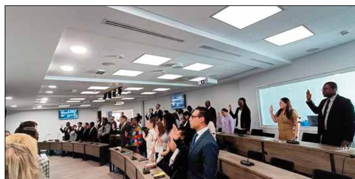
Class of 2023-2024 taking the Oath of Allegiance to the IMO International Maritime Law Institute