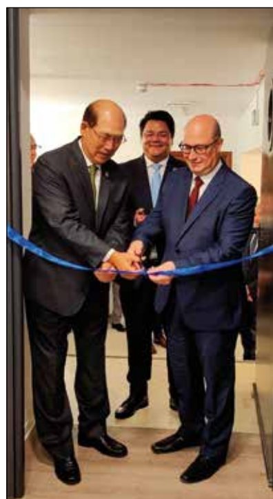
Mr. Kitack Lim (then IMO Secretary-General and Chairman of the IMLI Governing Board) and Hon. Minister Dr. Stefan Zrinzo Azzopardi (Minister for Public Works and Planning, Malta) cutting the ceremonial ribbon inaugurating the newly refurbished lecture hall

Minister Zrinzo Azzopardi delivered the Inauguration Address. He thanked all those who contributed to the realization of these projects, particularly the Government of Korea for the new student accommodation. Minister Zrinzo Azzopardi also stated that the celebration was not only of the new lecture hall and student accommodation, but also the principles and values that underpin IMLI's mission as a global educational institution. The Minister registered the pride of the Government of Malta, through