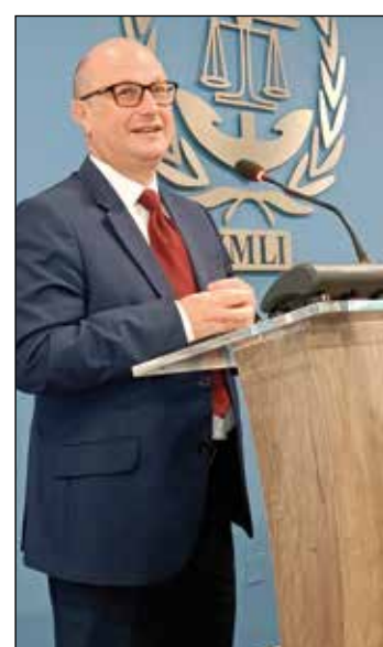
Hon. Minister Dr. Stefan Zrinzo Azzopardi (Minister for Public Works and Planning, Malta) delivering his address

the Ministry of Public Works and Planning of Malta, to have supported the full refurbishment of the IMLI lecture hall and the student common room.