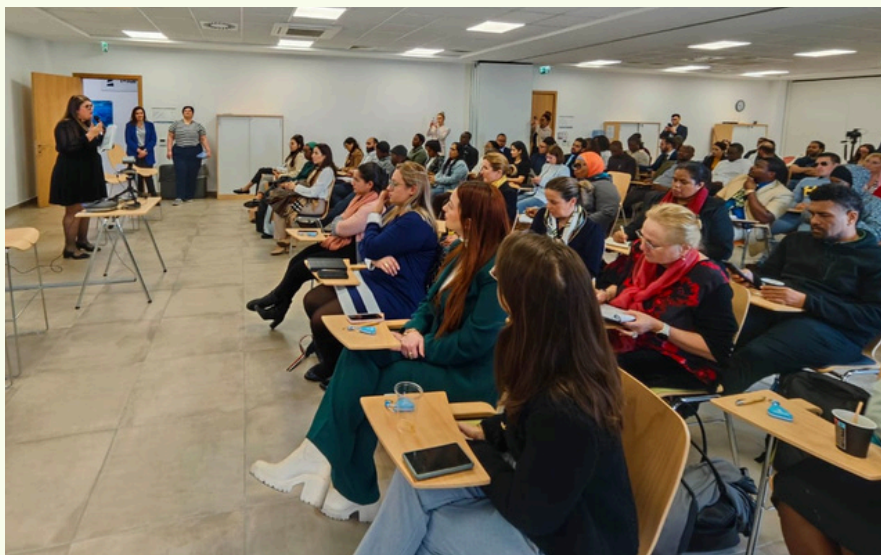
IMLI Class 2024-2025 attending the “She Leads the Seas” event organized by MaritimeMT

On 6 December 2024, the IMLI Class attended MaritimeMT's “She Leads the Seas” event, marking the conclusion of the Erasmus+ MARMED project which focused on skill enhancement and inclusivity in the blue economy. This event highlighted Malta's blue economy and women's roles in its growth, thereby inspiring success stories, and discussions on innovation and technology in the maritime sector. The event offered the IMLI students valuable insights on the maritime industry.