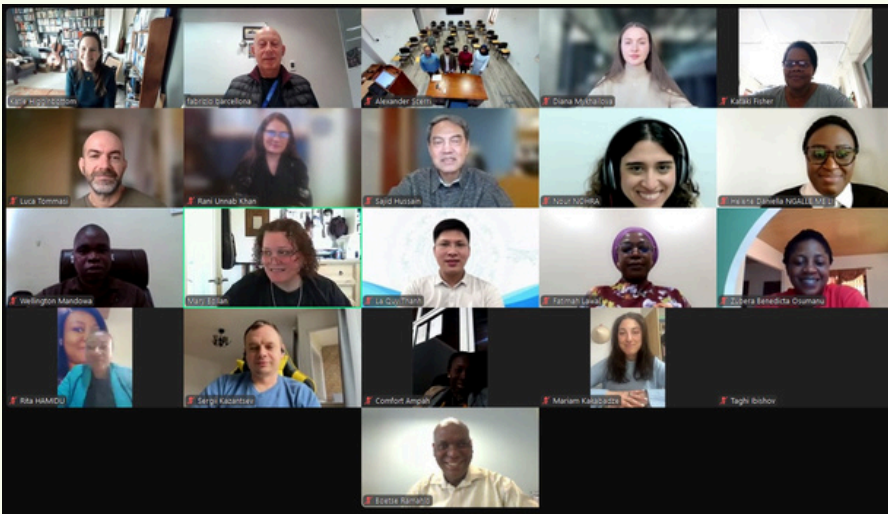
Speakers and Alumni hailing from both IMLI and WMU that attended this discussion meeting

The topic of discussion was the proposed amendments to the Maritime Labour Convention, 2006 in preparation of the April 25 meeting in Geneva of the ILO Special Tripartite Committee.