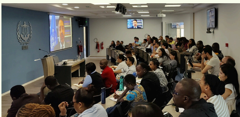
IMLI Class of 2024-2025 attending the inaugural lecture of this specialized course