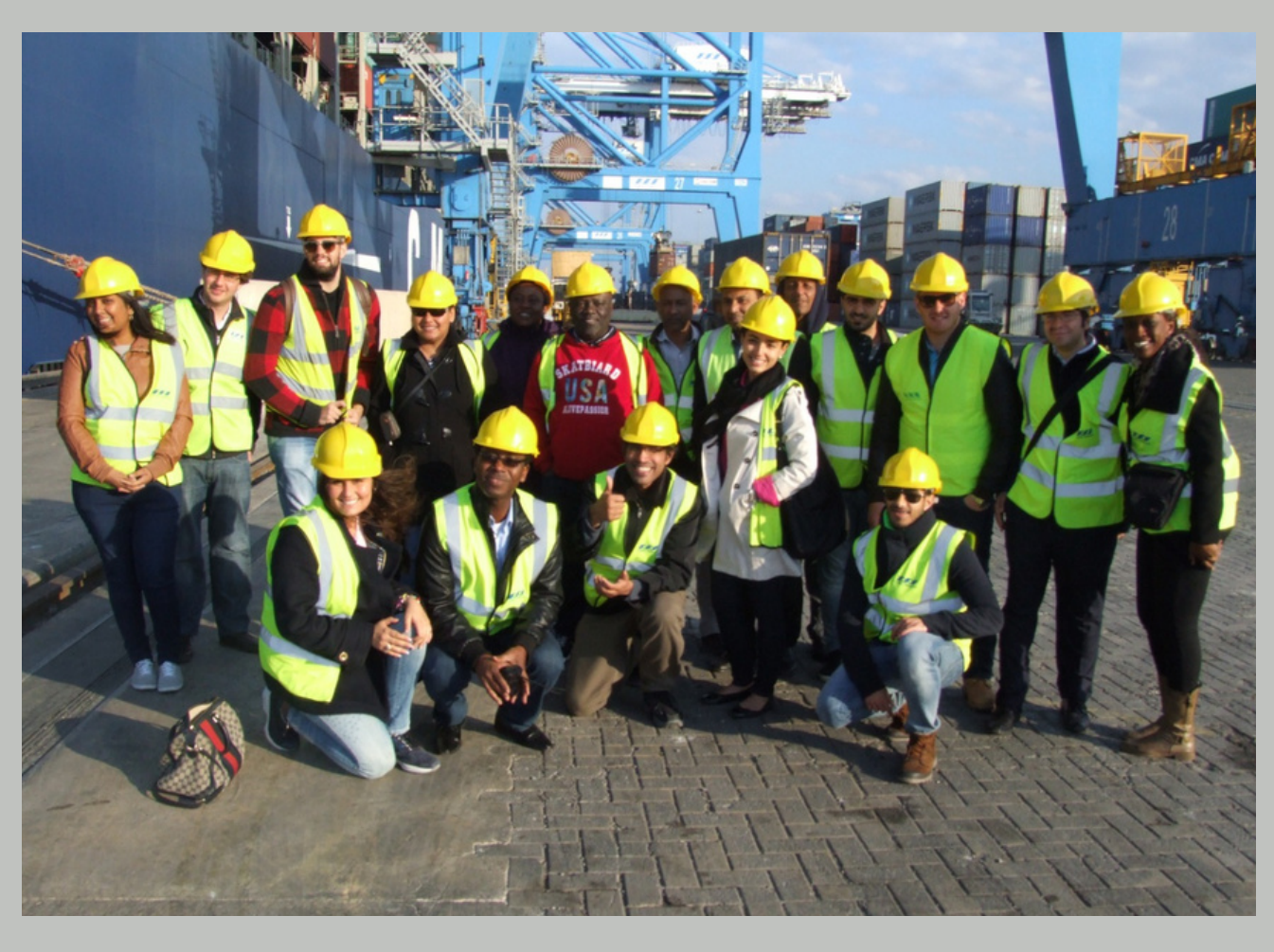
IMLI Class - Port Visit

Recognizing that a robust port system embraces technological advancements, including automation and digitalization, while ensuring safety, security and environmentally friendly activities, the Institute is pleased to offer for the sixth time the IMLI Course on the Law of Ports.