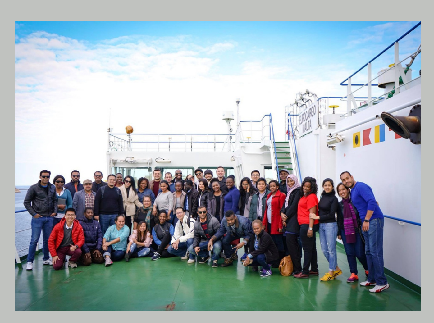
IMLI Class - Port Visit