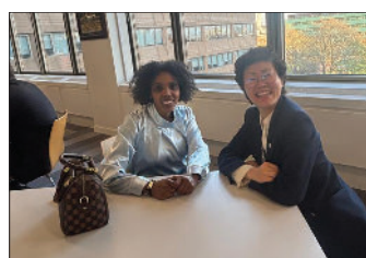
Students meeting their Mentors