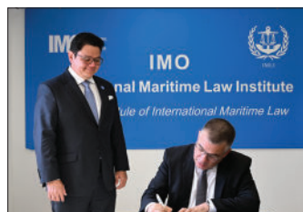
The Honourable Dr. Chris Bonett MP (Minister for Transport, Infrastructure and Public Works of Malta) signing the IMLI Distinguished Visitors Book

Following his introduction, the Honourable Minister delivered a lecture entitled " Malta – The Maritime Nation " to the IMLI Class of 2024-2025.