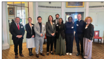
Members of the IMLI Class of 2024-2025 attended the Deep dive on Seafarer Sustainability Launch Event organized by Lloyd's Register Foundation at the Trinity House, London

The Class was divided into smaller Groups to allow them to visit the offices of these globally renowned organizations, many of which have not only contributed invaluable expertise and resources but have also been steadfast supporters of IMLI's mission throughout the years. As donors, they have provided crucial financial assistance, enabling the Institute to continue its vital capacity-building efforts. Thanks to their unwavering support, numerous deserving candidates from around the globe have been given the opportunity to be trained at IMLI. The visits provided students with firsthand insight into the work and impact of these organizations, deepening their understanding of the real-world application of international maritime law and fostering meaningful connections with industry leaders.