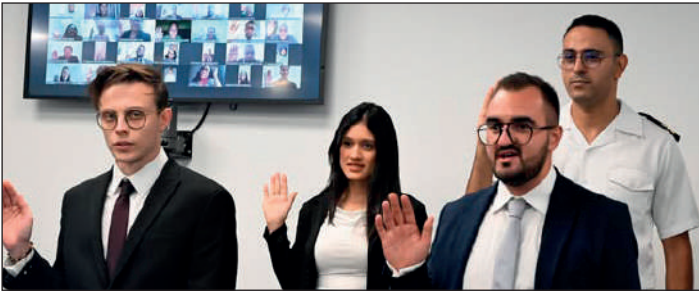
Class of 2025-2026 taking the Oath of Allegiance to the IMO International Maritime Law Institute