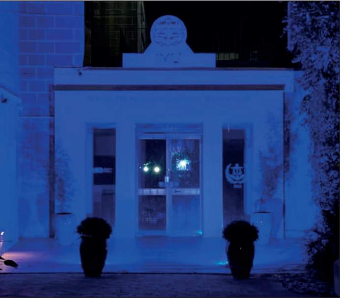
The Institute's façade lit up in maritime blue for World Maritime Day 2025

The theme chosen for this year, “ Our Ocean, Our Obligation, Our Opportunity ,” highlights the shared responsibility of the international community to safeguard the