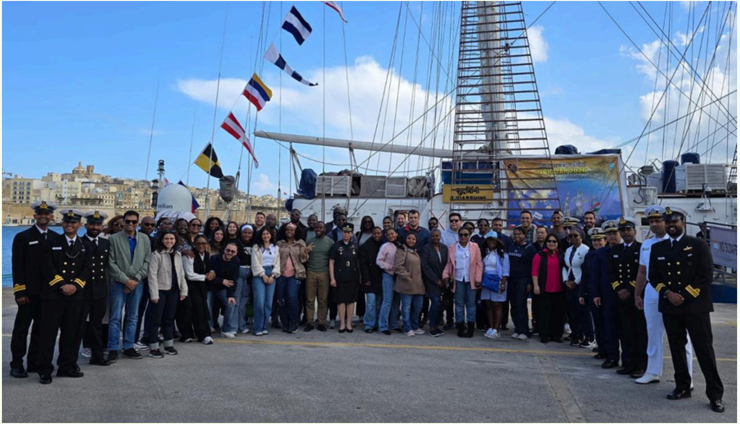
The IMLI Class of 2025-2026 together with the Officers of the “INS Sudarshini”

The IMLI Class of 2025-2026 together with members of the IMLI Faculty had the opportunity to visit the Indian Navy Vessel “INS Sudarshini” which was berthed in Malta.