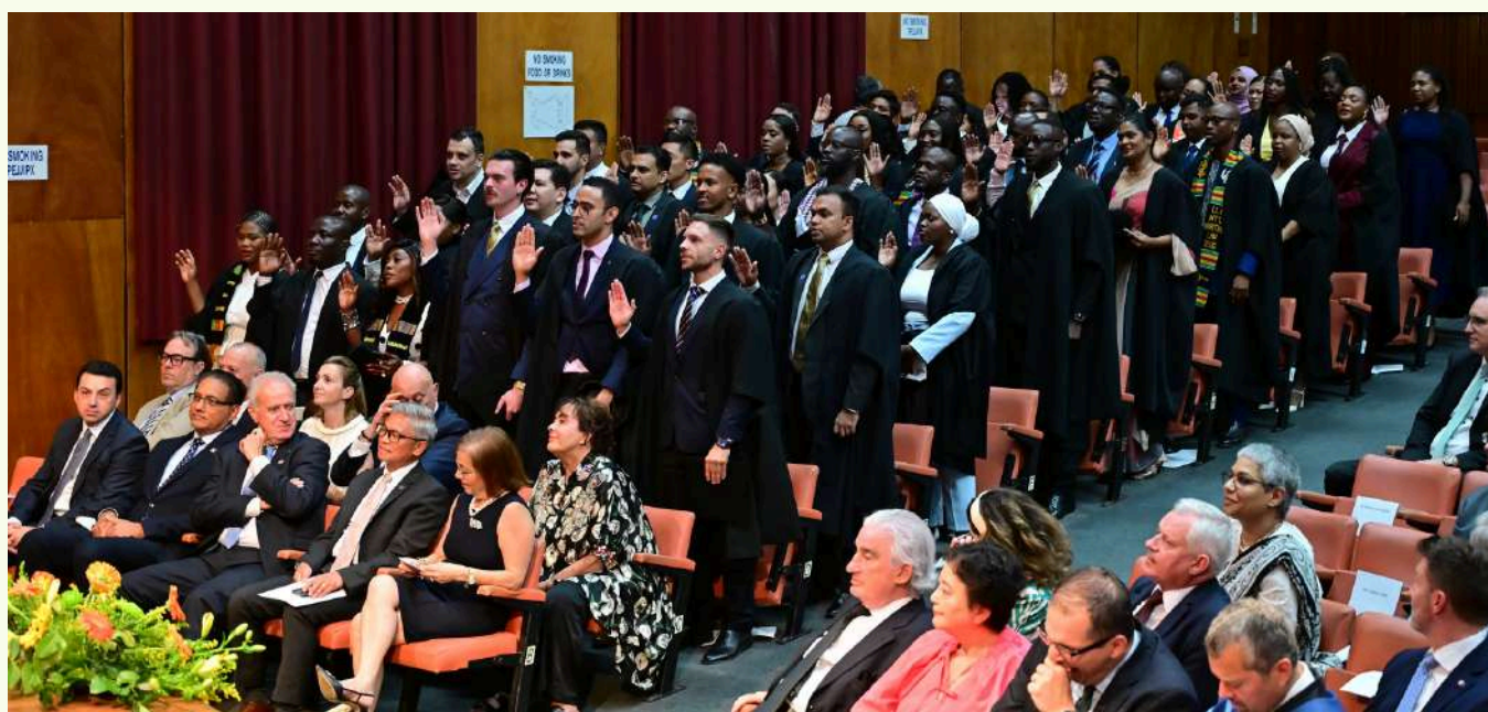
IMLI Class of 2025-2026 taking the Graduation Oath to the IMO International Maritime Law Institute