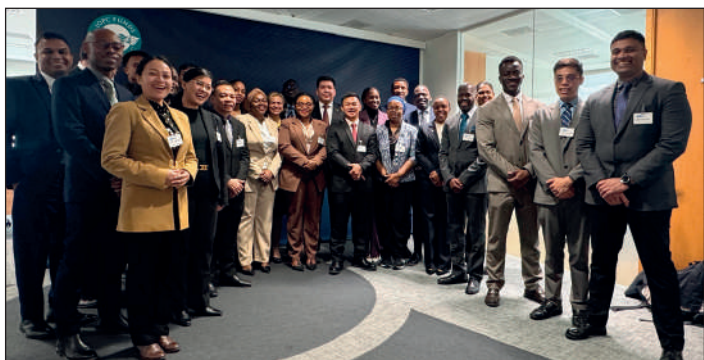
Members of the IMLI Class of 2025-2026 at the IOPC Funds