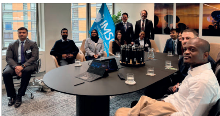
Members of the IMLI Class of 2025-2026 at the International Mobile Satellite Organization