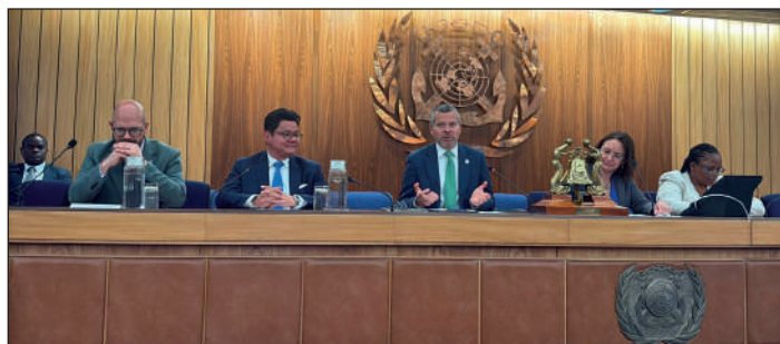
The distinguished Panel that addressed the IMLI Class of 2025-2026 at the Lloyd's Register Foundation event