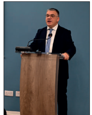
The Honourable Dr. Chris Bonett MP (then Minister for Transport, Infrastructure and Public Works, Malta)