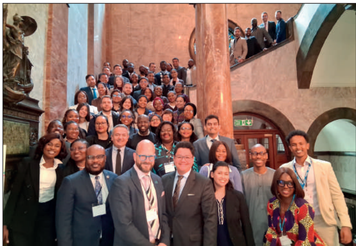
IMLI Class of 2025-2026 at Lloyd's Register Foundation