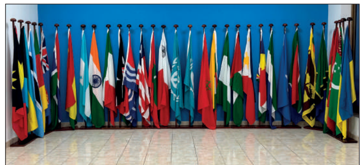
Country Flags on Display in the IMLI Foyer

Antigua & Barbuda, the Bahamas, Botswana, Cameroon, Fiji, the Gambia, Ghana, Honduras, India, Italy, Kenya, Kiribati, Liberia, Maldives, Malta, Morocco, Myanmar, Nigeria, State of Palestine, the Philippines, Seychelles, Sierra Leone, Somalia, South Africa, Sri Lanka, Tanzania, Togo, Türkiye, Turkmenistan, and Ukraine.