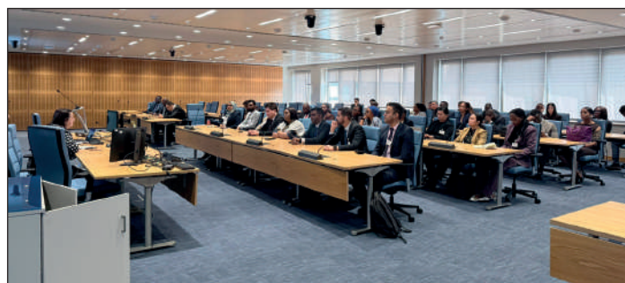
IMLI Class of 2025-2026 at IMO