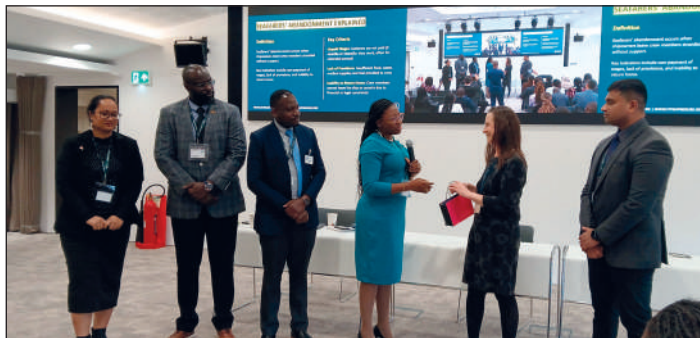
Members of the IMLI Class of 2025-2026 at the ITF Seafarer's Trust